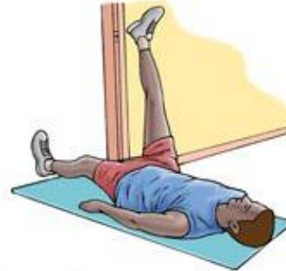
Hamstring stretch on wall