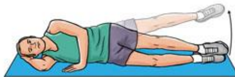
Side-lying leg lift