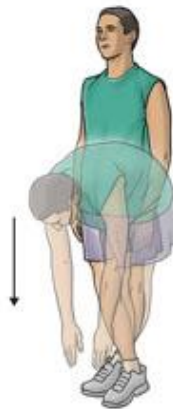
Iliotibial band stretch (standing)