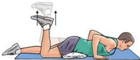
Prone hip extension (bent leg)