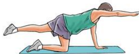
Quadruped arm/leg raise