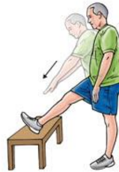
Standing hamstring stretch