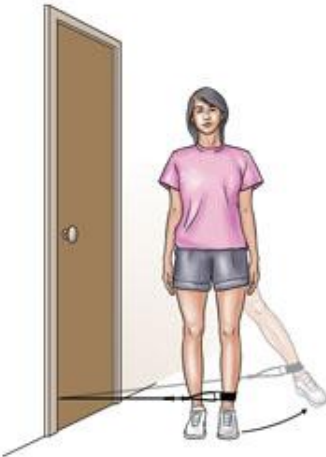
Resisted hip abduction