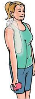
Resisted elbow flexion and extension