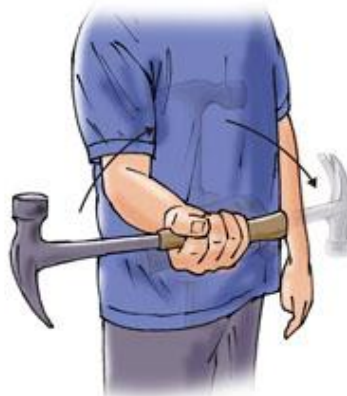
Forearm pronation and supination strengthening