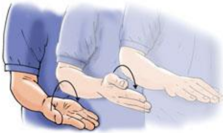
Forearm pronation and supination