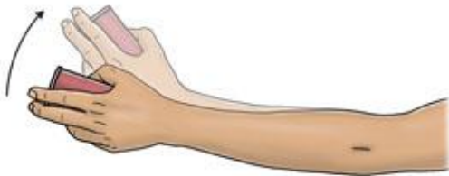
Wrist radial deviation strengthening