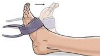
Resisted ankle dorsiflexion