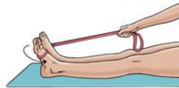
Resisted ankle eversion