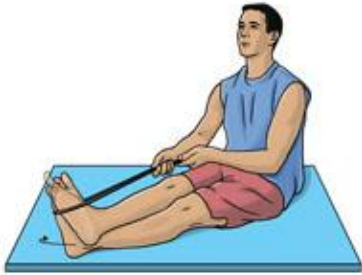
Resisted ankle inversion