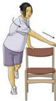
Balance and reach exercise B