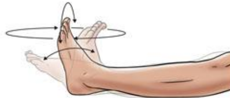
Ankle active range of motion