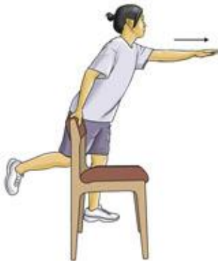
Balance and reach exercise A