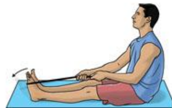
Resisted ankle plantar flexion