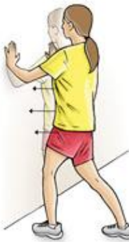
Standing soleus stretch