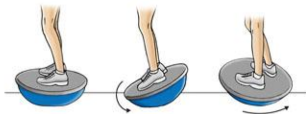
Wobble board exercise: D