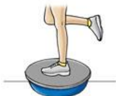
Wobble board exercise: E