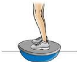
Wobble board exercise: C